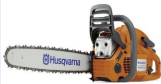
What to use?