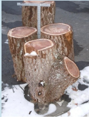
What to do?