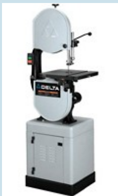
When to use?